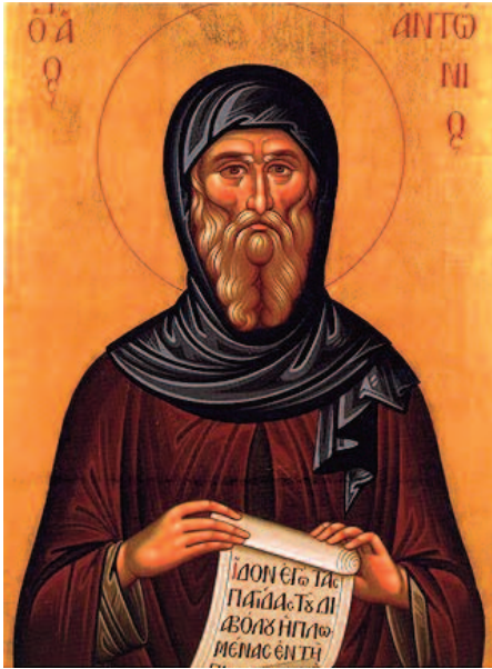
JANUARY 17 ST. ANTHONY THE GREAT