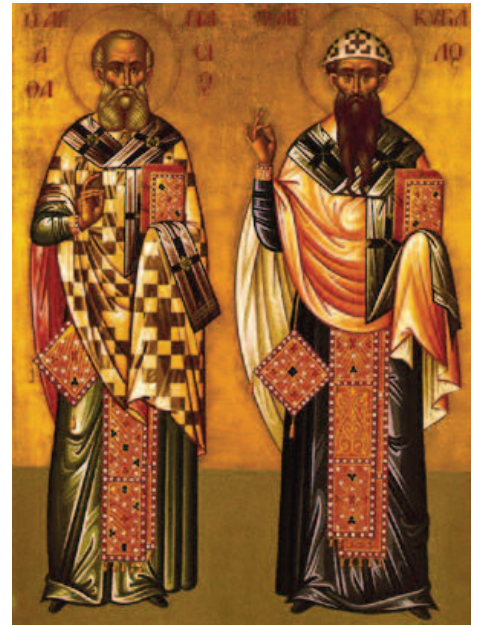
JANUARY 18 SS. ATHANASIOS AND KYRIL PATRIARCHS OF ALEXANDRIA