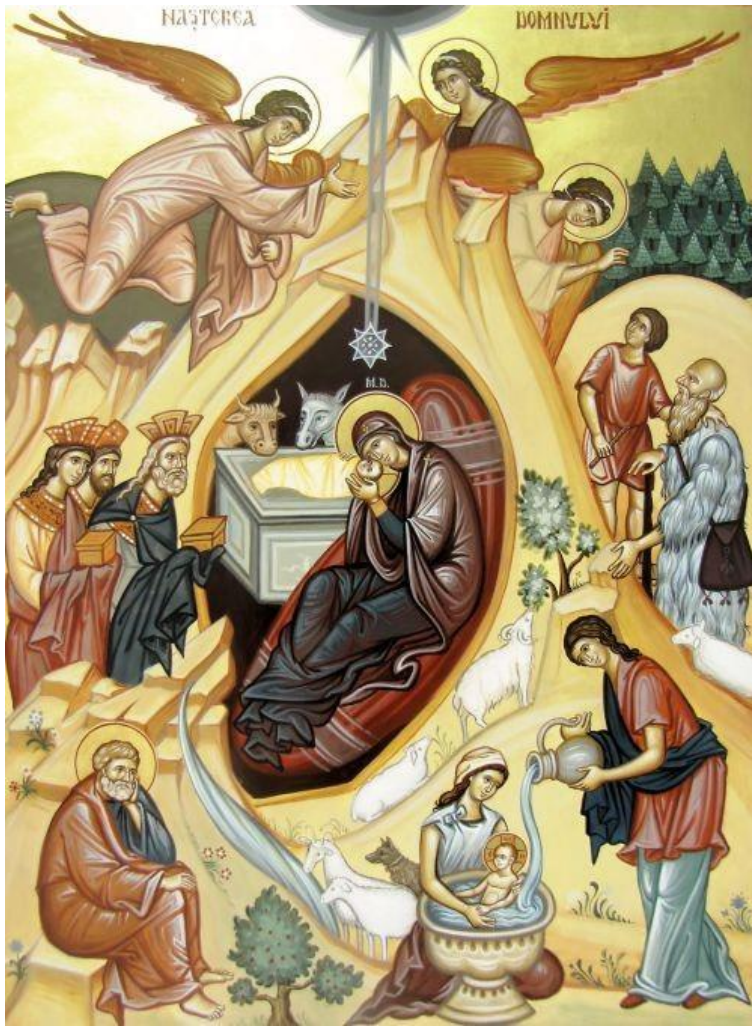
The Nativity of Our Lord and Savior, Jesus Christ